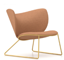
LOUNGE CHAIR wide edition h70 h82 f71 h38 volume m3 - 0,41 pack pcs - 1

LOUNGE CHAIR regular edition h64 h82 fl65 h38 volume m3 - 0,34 pack pcs - 1